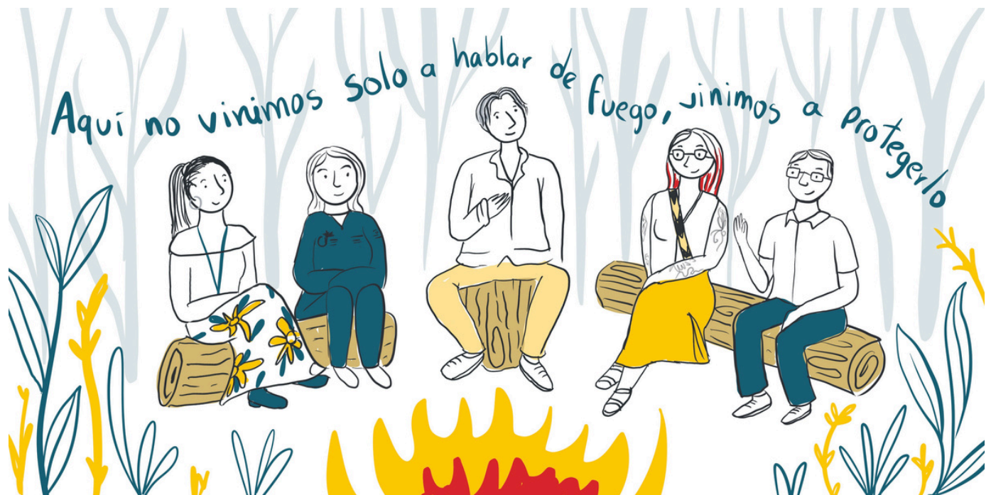
Illustration: Fernanda Barral/GIZ consultant

RAMIF's initiative brings together experiences to promote the exchange of knowledge in a face-to-face meeting in Colombia, culminating in the signing of concrete cooperation agreements.